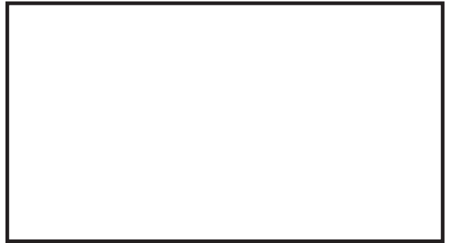
Day 6—Animals and Man

BIBLE VERSE TO LEARN: “And God saw every thing that he had made, and, behold, it was very good.”