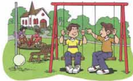
Invite a friend to church