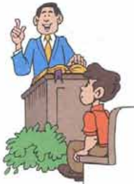
Go to church