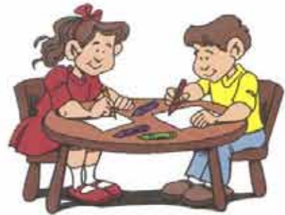
Attend Sunday School