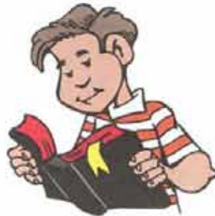
Read your Bible