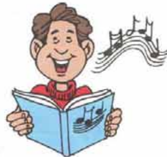
Sing songs about Jesus

To earn your next sticker, COMPLETE the activity