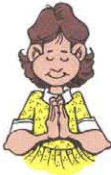
Pray Talk to God

Draw a line from the word YES to the pictures showing ways to learn about God's love. Circle the ways to share God's love with others. Some pictures may have a line and a circle.