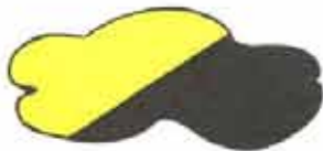
DAY 1 God created day and night.

God created all things. He created the heaven, earth and all things on earth. This took God only SEVEN DAYS! This is how it went.