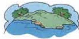
DAY 3 God separated the water and made the land appear.