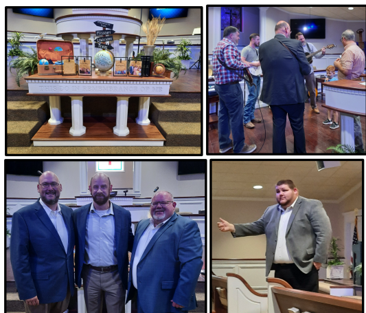
Missions Conference, Hyde Park MBC, West Monroe, LA